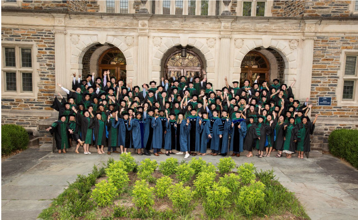
Doctor of Medicine Program Hippocratic Oath Ceremony Course

Electives Book is compiled and published by the Office of the Registrar of the Duke University School of Medicine. The information in this book currently is accurate to the best of our knowledge. However, policies, procedures, schedules, departments, course descriptions, enrollment limits, and faculty listings change periodically. For such updates, please refer to the Registrar's Office website: https://medschool.duke.edu/education/student-services/office-registrar . Faculty and students may also refer to the online course descriptions in DukeHub, dukehub.duke.edu/ . Errors and revisions to the Electives Book should be reported to the School of Medicine Registrar's Office, Box 3878, DUMC, Durham, North Carolina 27710, (919) 684-2304 or email: medreg@dm.duke.edu .