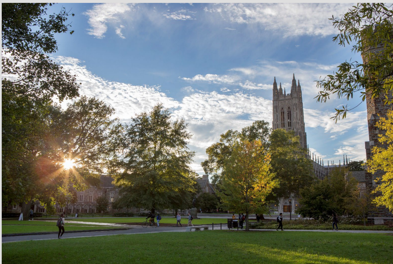
West Campus Scenic: Afternoon Sun – Abele Quad and Duke Chapel