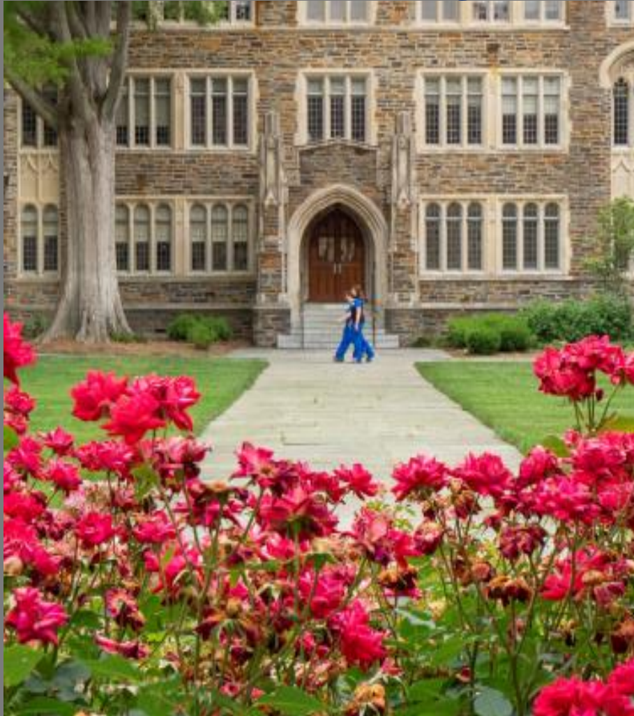
West Campus Scenic: Flowers in Front of Old Chemistry