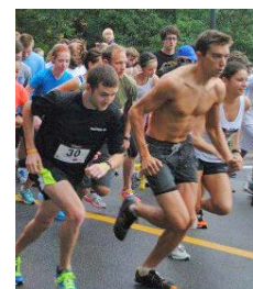
Student | 6