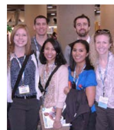
Alumni | 10