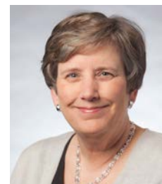
Faculty | 4