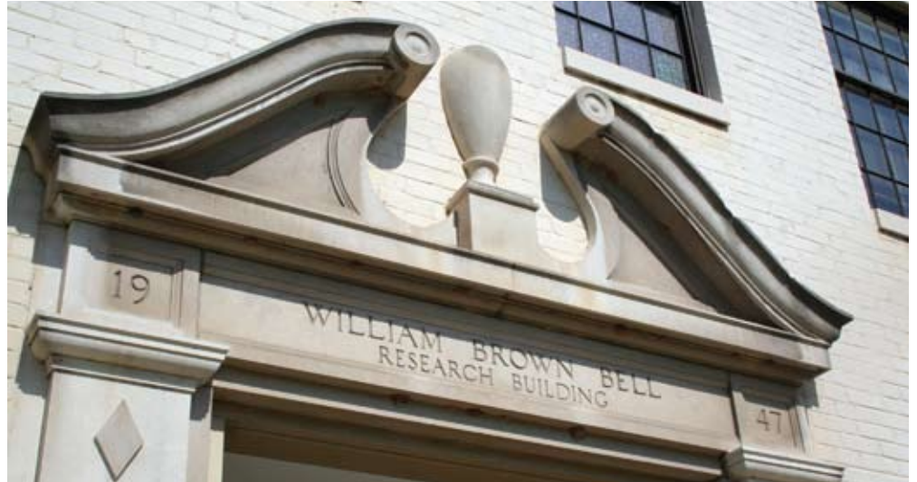
The historic Bell Building will be demolished in the Fall to make way for a new expansion to Duke University Hospital. Construction on the new building will begin in the Spring.

Sen. Kennedy returned home and will now undergo a series of chemotherapy and radiation treatment at Massachusetts General Hospital in Boston.